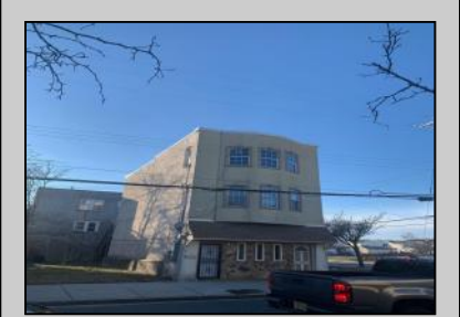
46 Maryland Atlantic City, NJ 08401