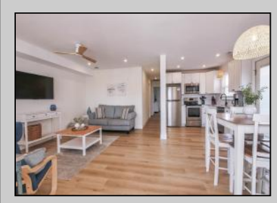
2526 West Ave Ocean City, NJ 08226