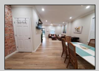
115 Congress Atlantic City, NJ 08401