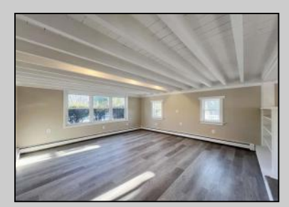
1340 Route 9 South Ocean View, NJ 08230