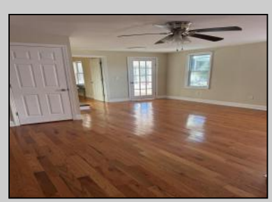
1421 Ocean Ave Pleasantville, NJ 08232