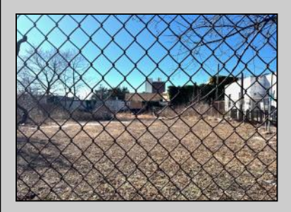
188 Main St Pleasantville, NJ 08232