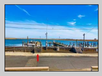
25 12th Brigantine, NJ 08203