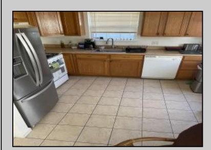
132 Brighton Ave Pleasantville, NJ 08232