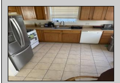
132 Brighton Ave Pleasantville, NJ 08232