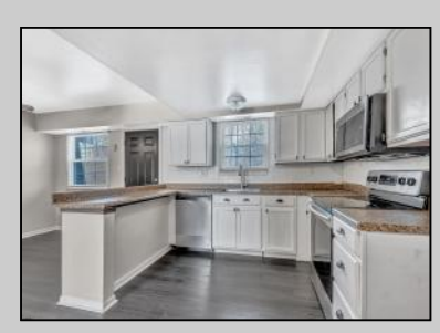
5003 Cardiff Mays Landing, NJ 08330