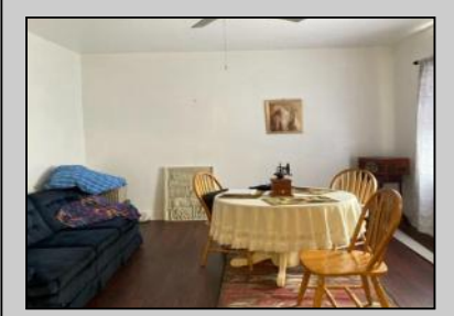
1315 White Horse Pike Egg Harbor City, NJ 08215