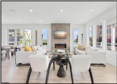
109 Oxford Ventnor, NJ 08406