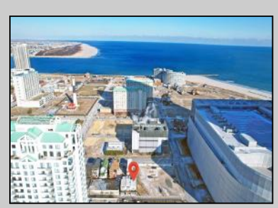
125 Congress Ave Atlantic City, NJ 08401