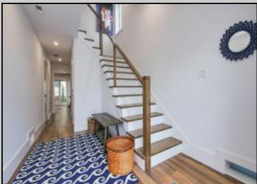
10 Knight Margate, NJ 08402