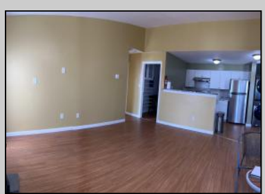
700 Franklin Blvd Pleasantville, NJ 08232