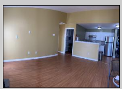
700 Franklin Blvd Pleasantville, NJ 08232