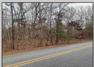
662 Dogwood Ave Egg Harbor Township, NJ 08234