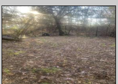
124 Church Egg Harbor Township, NJ 08234