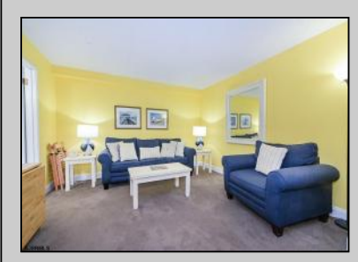
812 Ocean Ocean City, NJ 08226