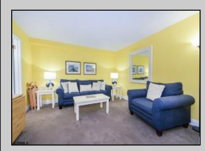
812 Ocean Ocean City, NJ 08226