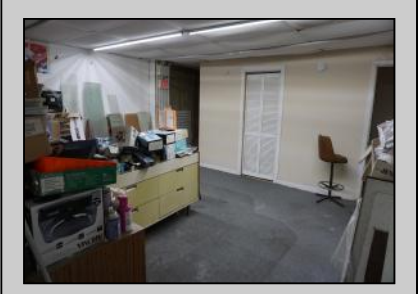
1530 Atlantic Atlantic City, NJ 08401