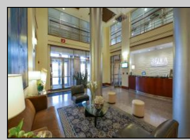
526 Pacific Atlantic City, NJ 08401