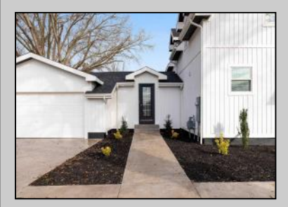
501 Cologne Port Galloway Township, NJ 08215