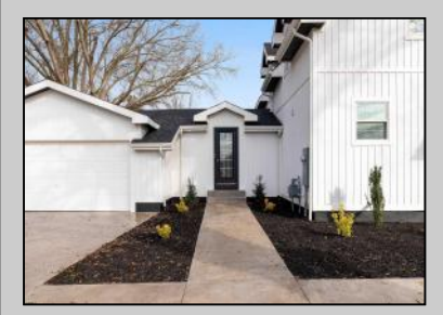
501 Cologne Port Galloway Township, NJ 08215