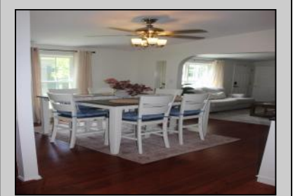
194 Pebble Beach Hamilton Township, NJ 08330