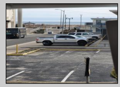
3501 Pacific Ave Atlantic City, NJ 08401