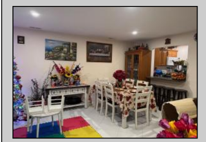
3221 Juniper Mays Landing, NJ 08330