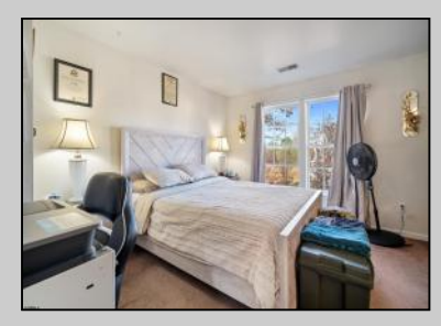
72 Jamestown Mays Landing, NJ 08330