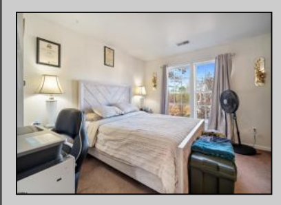
72 Jamestown Mays Landing, NJ 08330