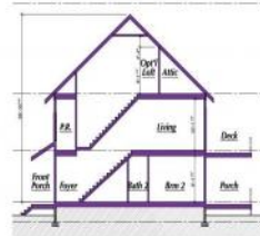
SECTION @ FOYER