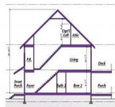
SECTION @ FOYER