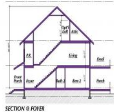
SECTION @ FOYER