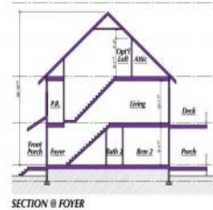
SECTION @ FOYER