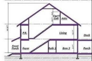
SECTION @ FOYER