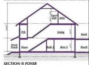
SECTION @ FOYER