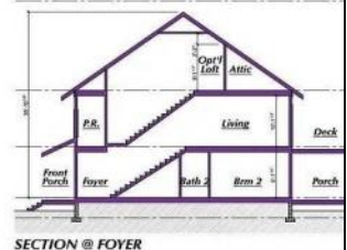
SECTION @ FOYER