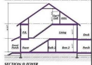
SECTION @ FOYER