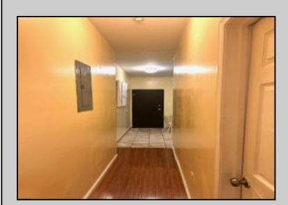
1019 Arctic ave Atlantic City, NJ 08401