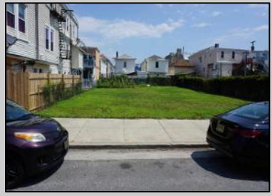
19-21 Texas Atlantic City, NJ 08401