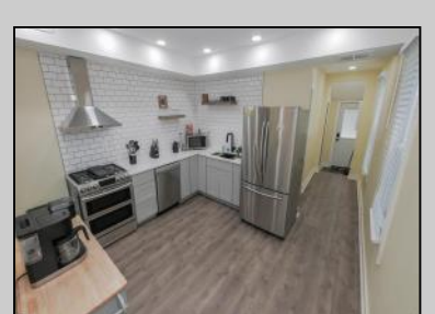
527 Melrose Ave Atlantic City, NJ 08401