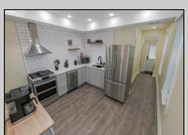
527 Melrose Ave Atlantic City, NJ 08401