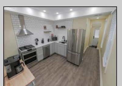
527 Melrose Ave Atlantic City, NJ 08401