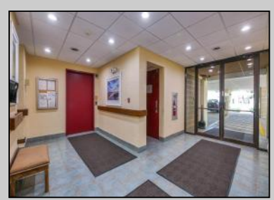
4540 Brigantine Brigantine, NJ 08203