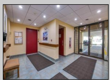
4540 Brigantine Brigantine, NJ 08203