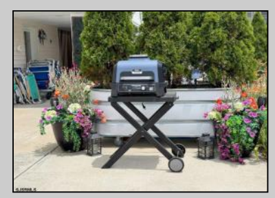
35 Laclede Pl Atlantic City, NJ 08401