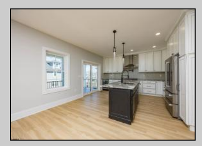
1904 Atlantic Ave North Wildwood, NJ 08260