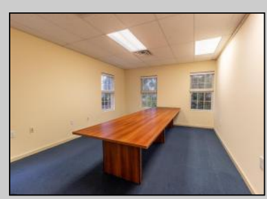
337 Jimmie Leeds Galloway Township, NJ 08205