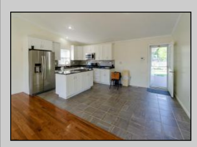
1112 Buck Millville, NJ 08332