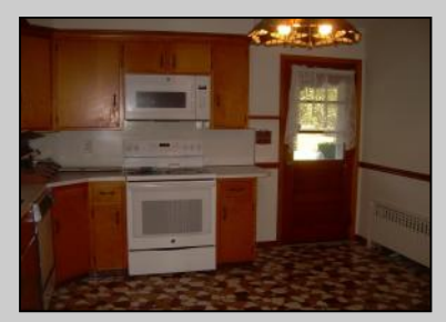
375 FOSTER AVE Vineland, NJ 08360