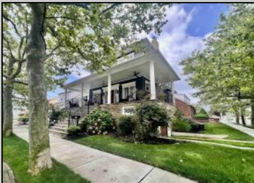
26 Richards Ventnor, NJ 08406